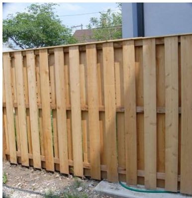
Board on board or shadowbox