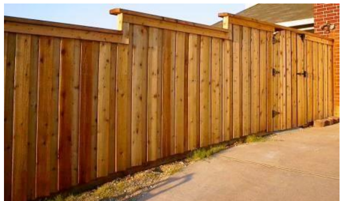
Stepped board on board or shadowbox